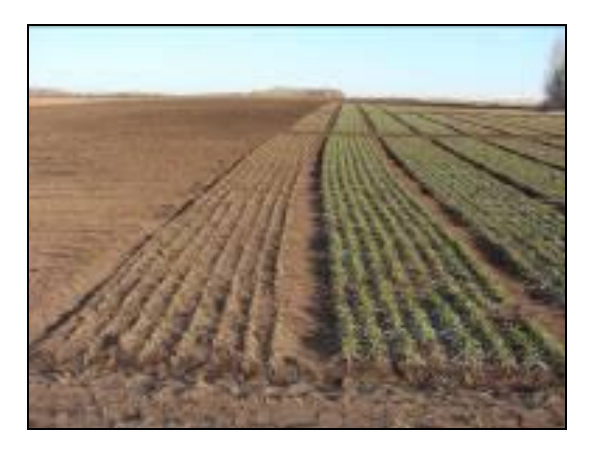
Figure 3. Crops of winter wheat, "Kazan 560" (on the left control band without treatment

Thus, based on laboratory and field studies we have shown that as a result of electromagnetic microwave and EHF exposure increased groundwater germination, reduced mortality among the illnesses, improves the growth of seedlings, and as a result of increased yield of the seedlings. Figure 4 shows the wheat crops treated with electromagnetic fields, microwave and EHF ranges and without treatment with electromagnetic fields, microwave and EHF bands.