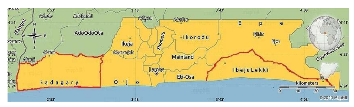
Figure 1. Map of Lagos State, Nigeria Showing the Study Areas

The study was carried out in ten (10) "purposively" selected fishing communities in the Lagos coastal area. From the eastern axis (Ibeju-Lekki), marked in red to the right hand side of the map, five communities were selected and they include Folu, Idasho, Olomowewe, Origanrigan and Oshoroko. And five communities selected from the western axis (Badagry), also marked in red to the left hand side of the map, were Asakpo, Ogorogbo, Gbethromey, Gberefun and Seishi. The selection of the communities was "purposive" based on fishing intensity and communities' acceptance for the research to be conducted. Some fishing communities have been very hostile in recent times and refuse the conduct of questionnaires research. Structured administered among twenty (20) "randomly" selected fishers from each community and in total, 200 questionnaires were administered and retrieved. The 100% made possible because retrieval rate was administered directly by questionnaires were researchers who also assisted in completing them for the purpose of speed and accuracy. Focus group discussion, beach observation and direct interviews were conducted for further confirmation of some issues raised in the questionnaire as well as confirming the number of active fishing canoes. Physical observation of fish landing, counting and identification of types of fishing canoes at the beaches were made possible through this process.