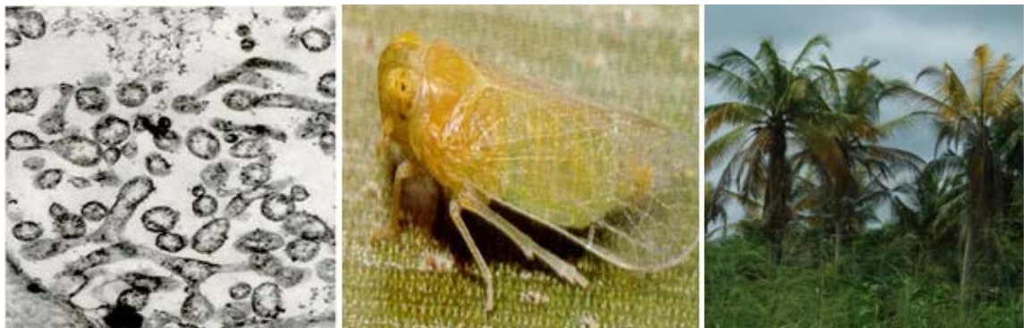
Figure 2. (A)Cell wall-less pleomorphic bacteria (B) Putative Vector (C) Diseased Palms