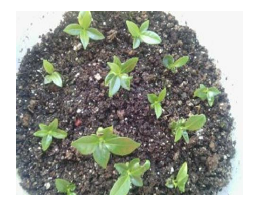
Figure 4. Plantlets at acclimatization stage

During the first six weeks the time required for callus development was observed. After four to six weeks in the callus induction medium, the explants were sub cultured into the advanced callus induction containing MS2 media (see Appendix 1) based on [11], and [12]. The cultures were incubated in a dark condition at 25\pm1^{\circ} C. Sub-culturing was done every month (Figure 1). During sub-culturing, the aqueous callus and contaminated jars were discarded. Evaluation of the amount of callus developed was done 6 months after initiation.