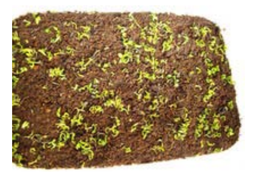
Figure 3. Germinated embryos